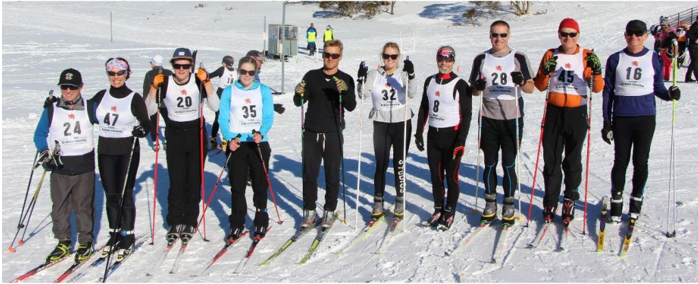
Our Cross-country team looking fit and fresh before the race