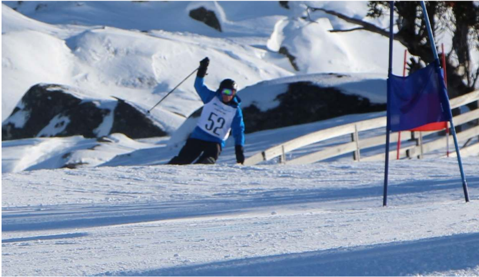
Mark Phillips waving to the crowd as he cruises through the toughest part of the course