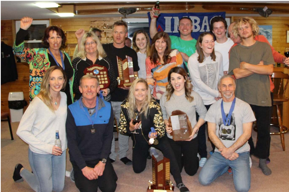
Members of the victorious Maranatha 2017 team

These individual results enabled Maranatha to be crowned the 2017 Brian Donegan Memorial Senior Interclub Champion , with Port Kembla 2 nd and Illawarra 3 rd