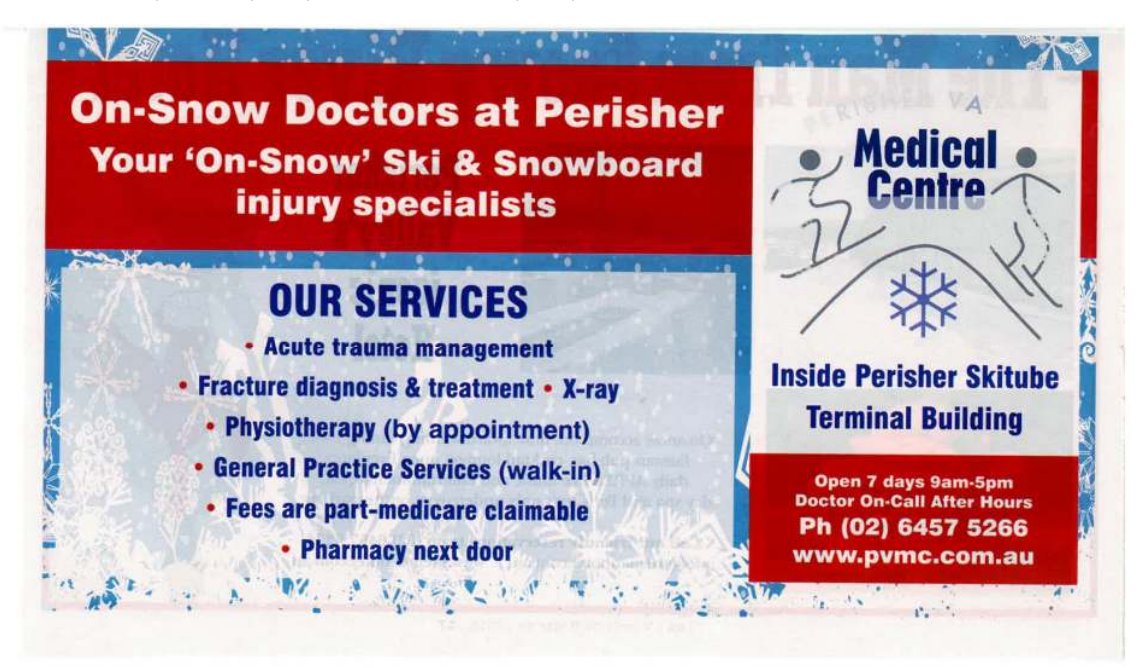
New meaning for a SKI holiday

Print this and put it in your parka or save it to your phone.