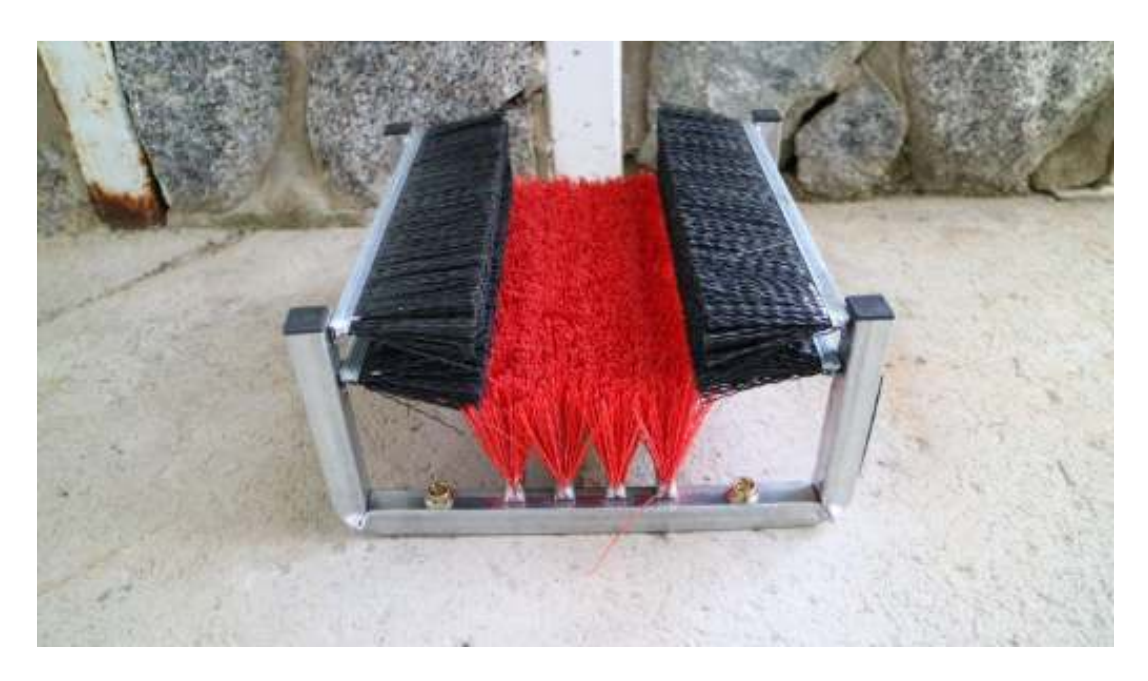
The new boot cleaner at the front door. Don't forget to use it before entering the lodge