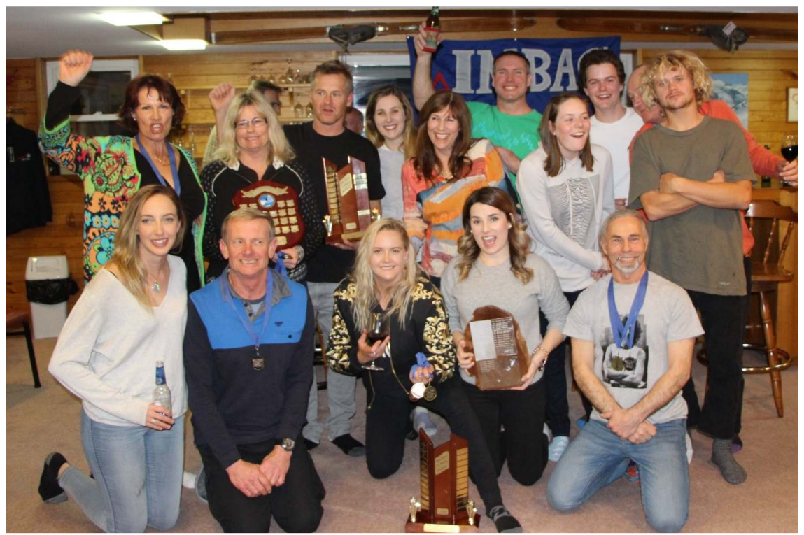
Members of the victorious Maranatha 2017 team

Please see the following tables for individual times.