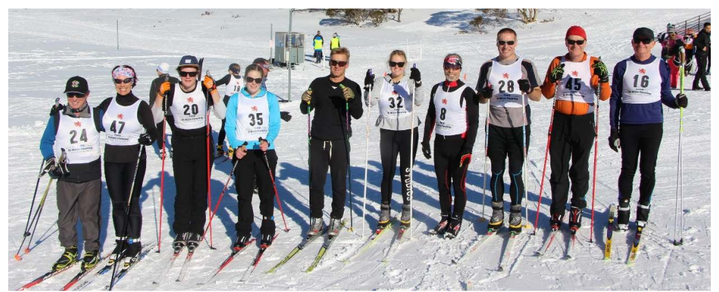
Our Cross-country team looking fit and fresh before the race