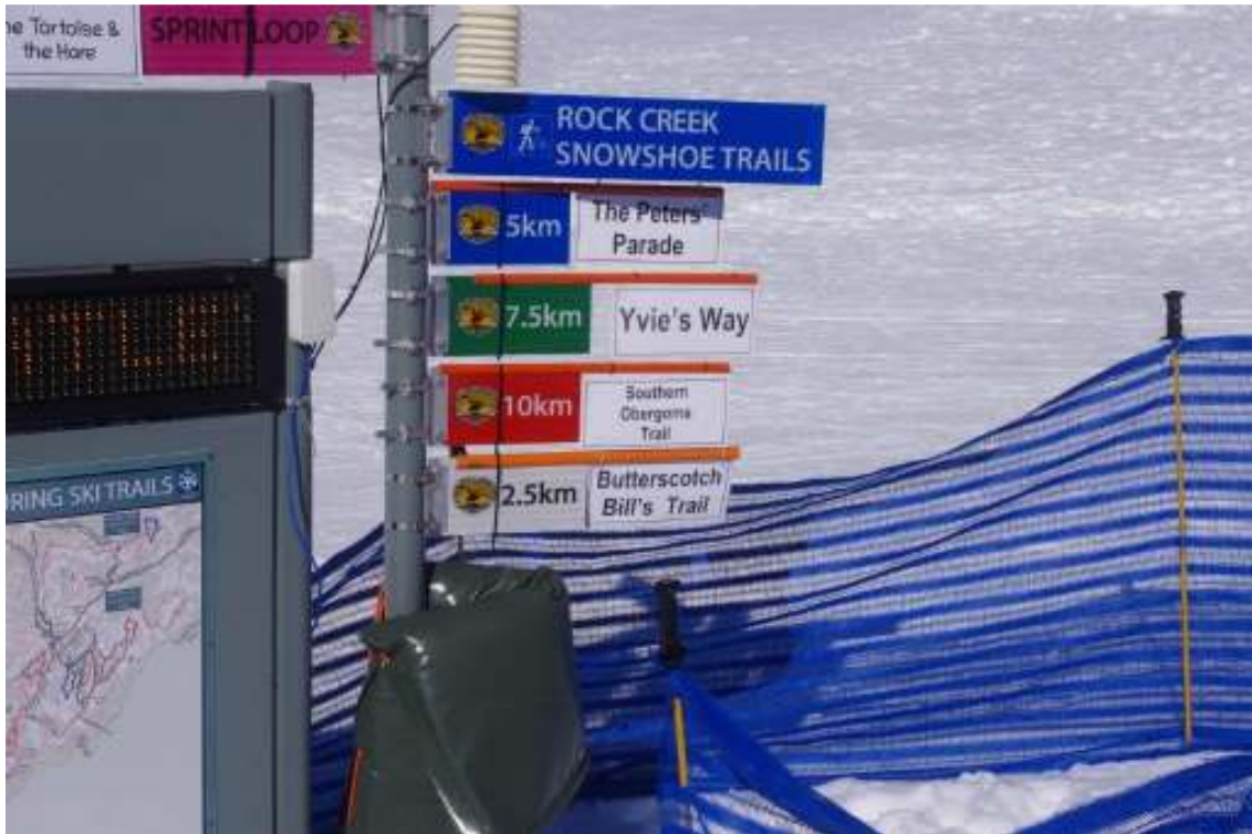
The 2.5k trail showing its new name